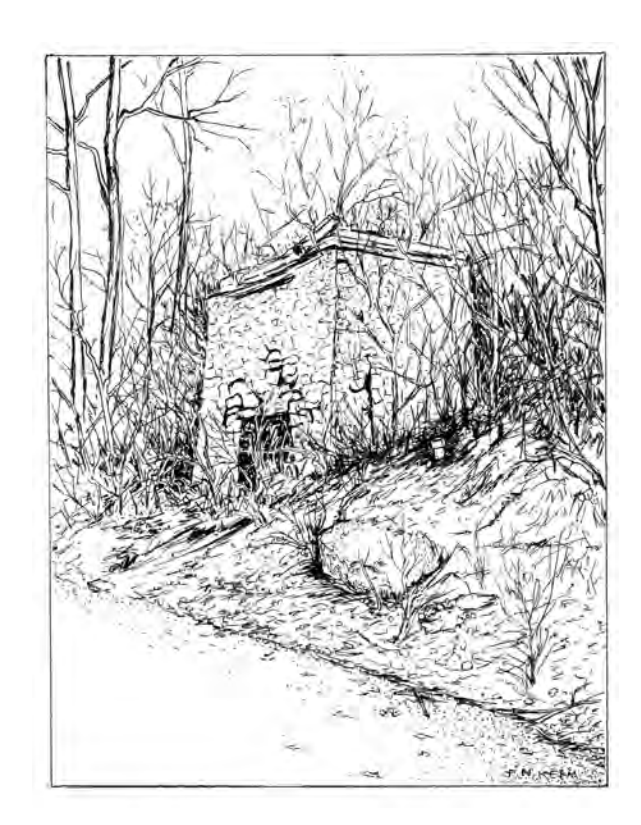
Historic Sites of Salisbury Township